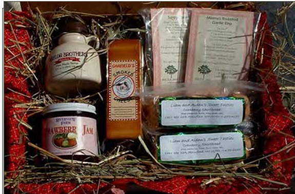
GRANGE XMAS GIFT BASKET