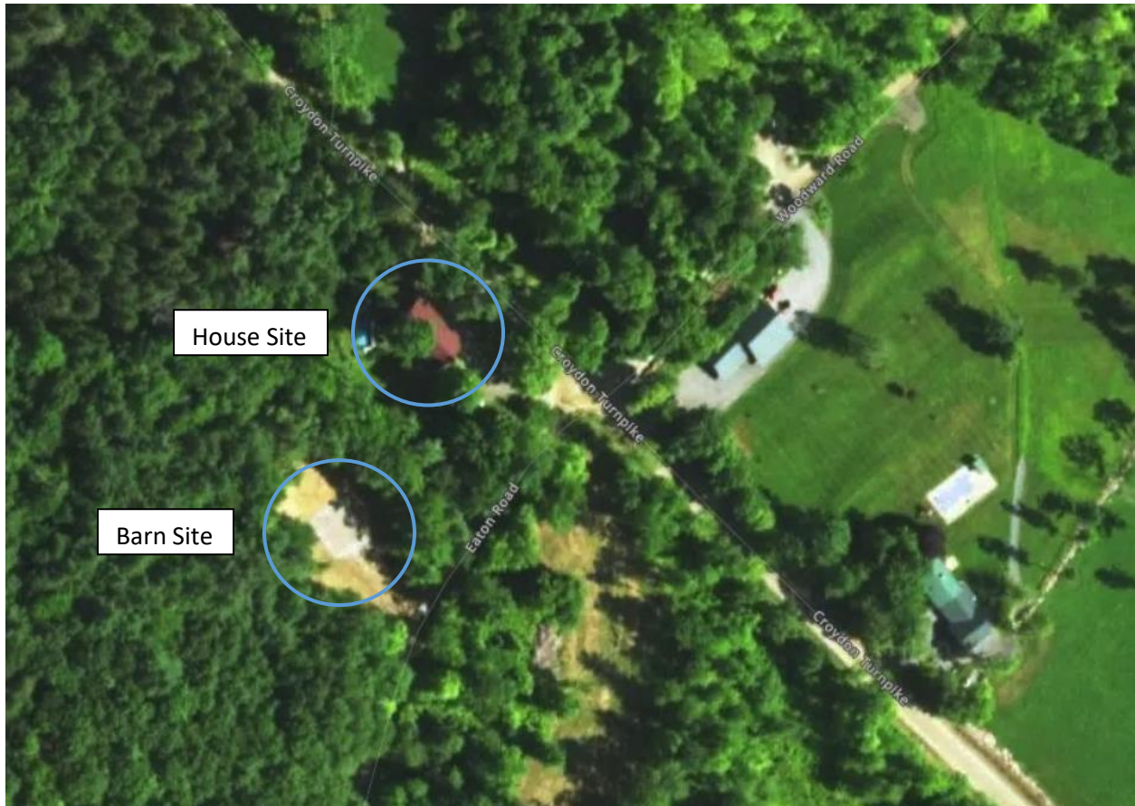
Maps: (Top) Aerial Map - Spring 2016 showing barn foundation. (Bottom) 168 Croydon Tpke lot lines.