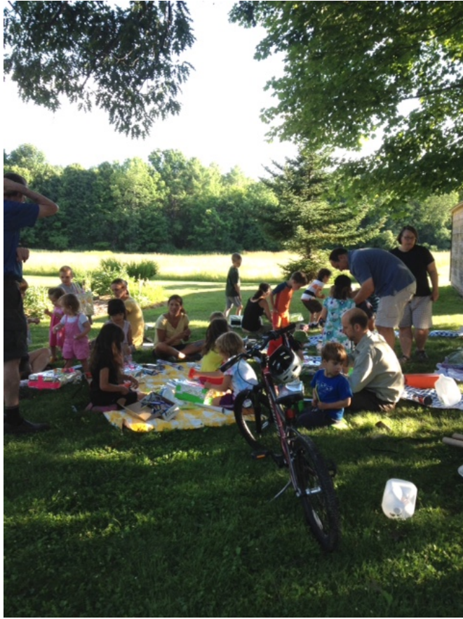
Building Robots, Meriden Library Lawn, July 2014