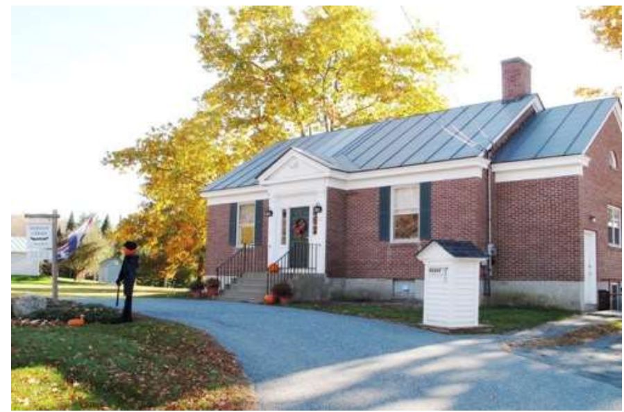
Fall at the Meriden Library, a great time for a book!