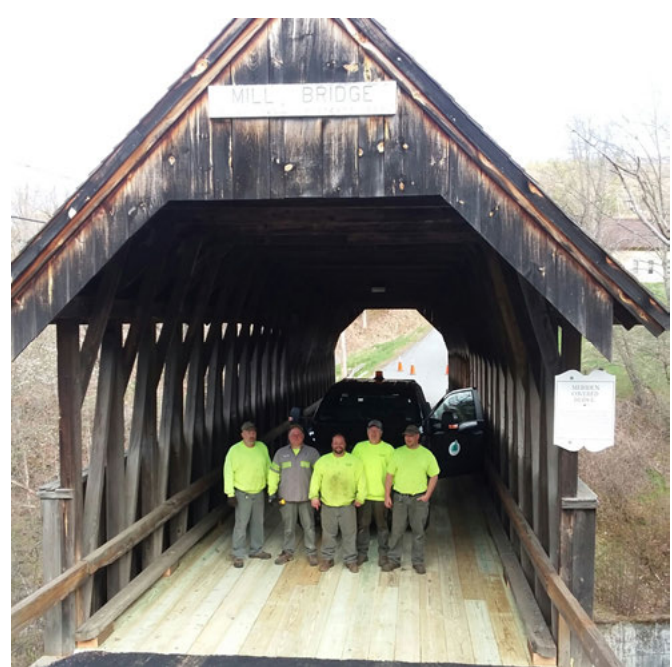
Total Expenditures $109,232

Meriden Covered Bridge 2020 (steel cleaned painted, new deck installed) Modern Protective Coatings Inc/Plainfield Highway Department