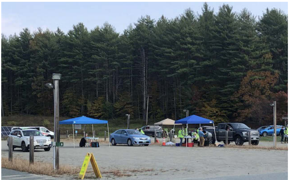
2020 Drive thru flu clinic, socially distanced