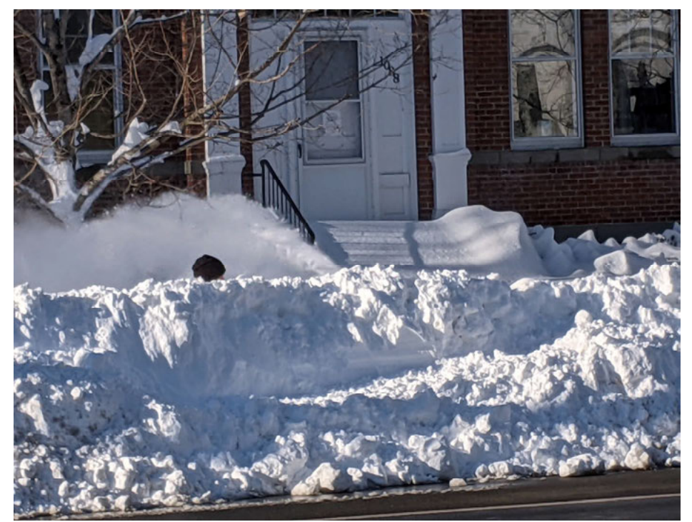
Highway Employee Mike Collins snow blowing the sidewalks in Plainfield Village.