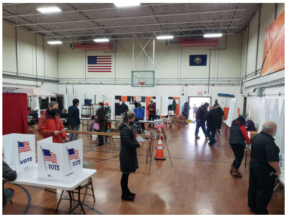
2020 November Election, socially distanced.